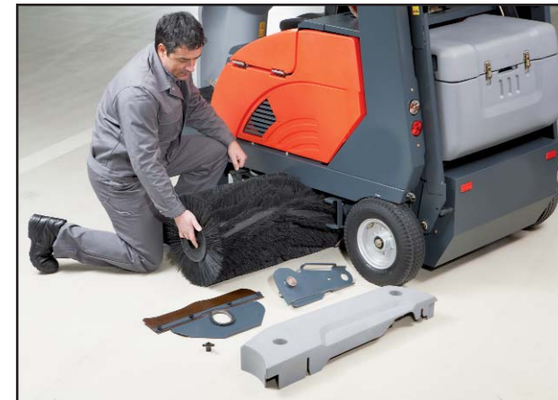
Change-out of main sweeping brush requires no tools and is quick and simple.