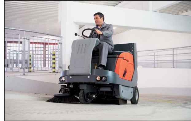
Great for use in indoor or outdoor applications because of the option to choose gas, diesel or battery operated.

The design concept is an ideal combination of a host of key benefits.