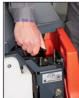
The control for the large dirt flap allows the operator to pick up large items during the course of sweeping.