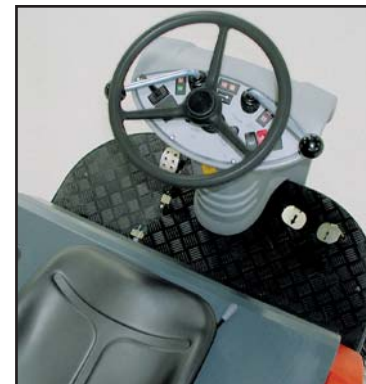
The simple design of the operator controls means less operator error.