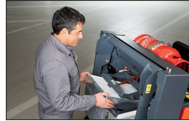
Easily accessible high performance filter system ensures clean exhaust air.