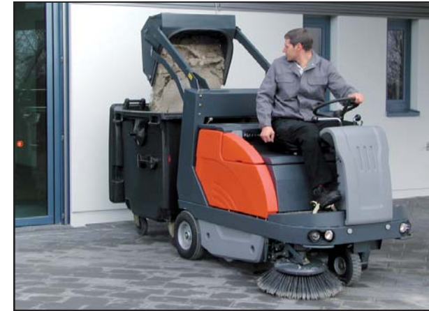
The high dump hopper can be easily emptied into large containers.